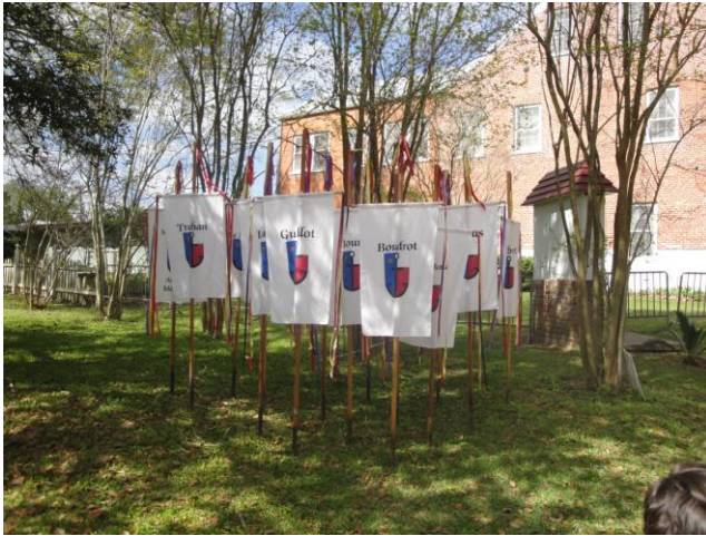
Acadian Family Banners