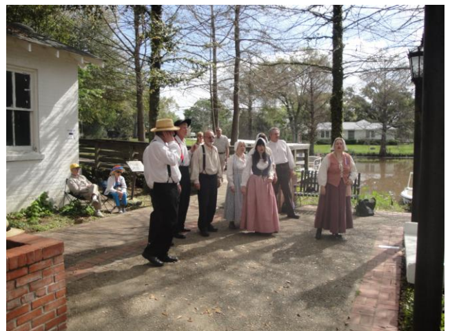
Renaissance Cadienne perform at the Acadian Memorial Festival in St. Martinville, Louisiana, March 19, 2011