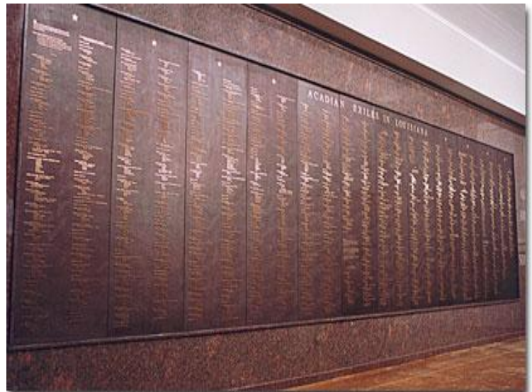
Wall of Names, Acadian Memorial